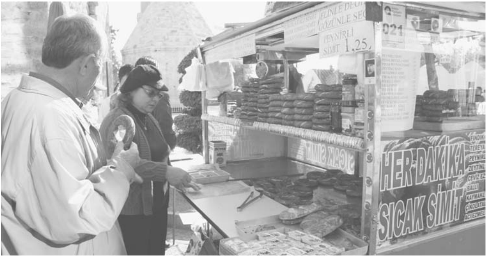
A street vendor selling simit (ring-shaped bread) and other dishes in Antalya, Turkey.

of charity. During the Ottoman times, imarets became an indispensable part of the urban landscape, offering free food for the needy. The recent phenomenon of setting up charity tents during the fasting month of Ramadan that distribute free full course meals to all to break the fast stems from this tradition.